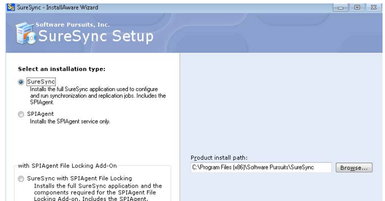
Figure 3 The new consolidated installer will allow you to select which components you want to install.

SureSync now supports resuming a file transmission which was interrupted due to an error or a network communication problem. For example, if SureSync is half way through a 1GB file when a network communication problem results in a dropped path, the program will resume that file from the halfway point, reducing the